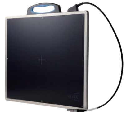
Configuration Detector FXRD-1417SA/B System Control Unit FXRS-02A Designed and manufactured by Vieworks in Korea